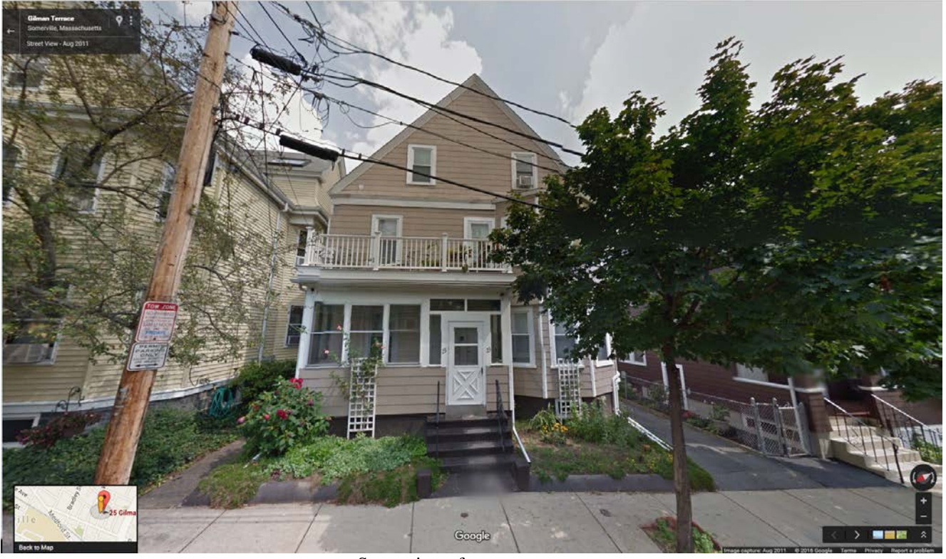
Street view of property